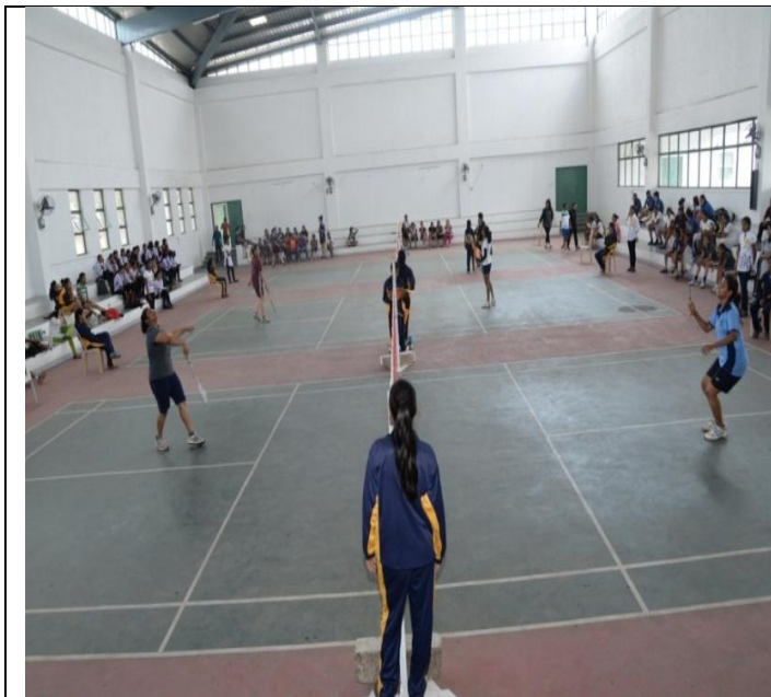
Indoor Game (Badminton)