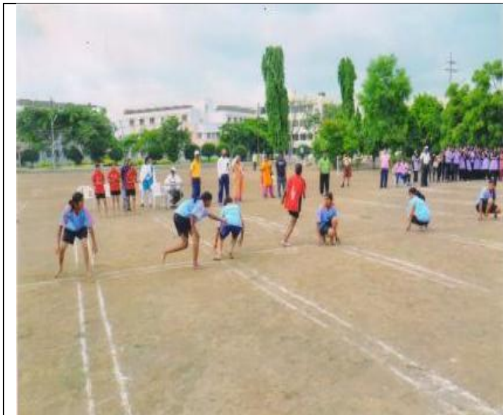
KHO KHO Ground